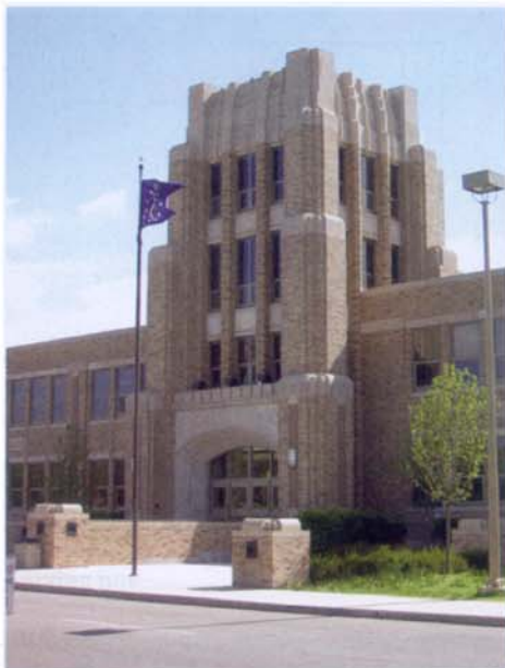
Main tower entry (After)